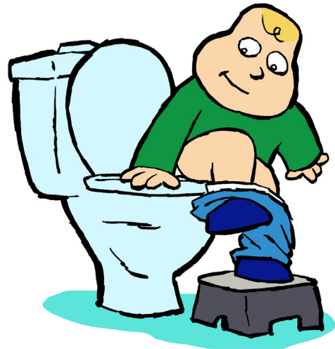
On the toilet