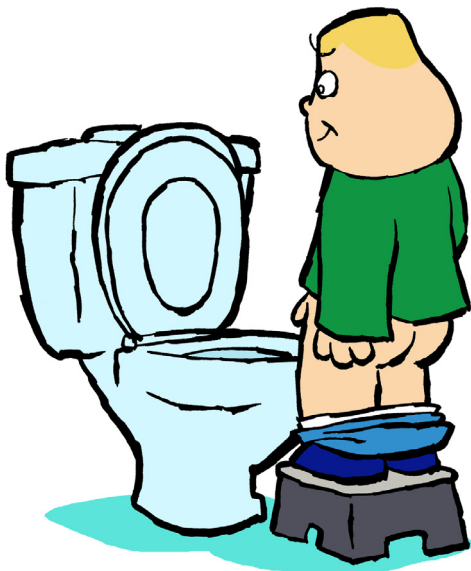
Stand up for a 'wee'