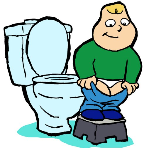
Pull up pants