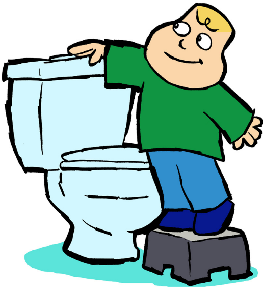
Flush the toilet