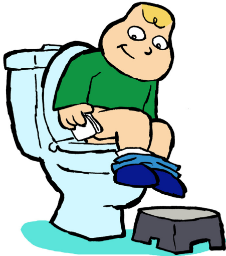
Wipe bottom with toilet paper