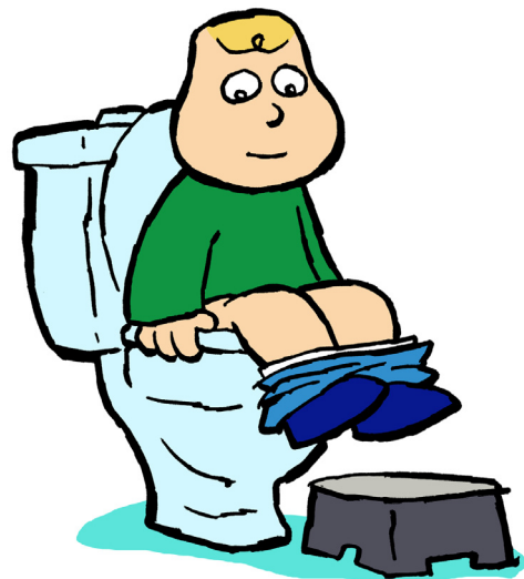
Sit on the toilet