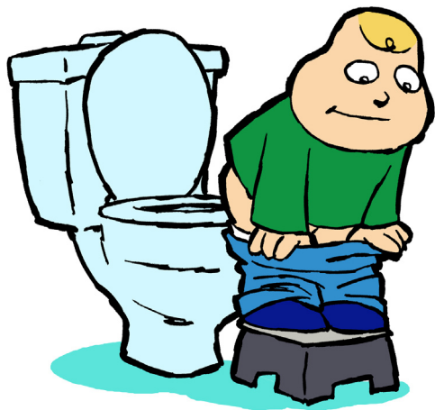
Pull pants down